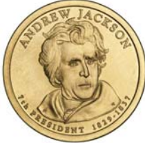
Andrew Jackson $1 Coin