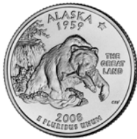
Alaska Commemorative Quarter-Dollar Coin

Fourth Quarter Fiscal Year (FY) 2008 Financials: FY 2008 fourth quarter total revenue increased 22 percent from the same quarter last year. Circulating revenue decreased by 22 percent, and numismatic revenue decreased by 21 percent, while bullion revenue increased by 321 percent compared to fourth quarter FY 2007 revenues. FY 2008 year-to-date total revenue was six percent above FY 2007 fourth quarter cumulative revenue.