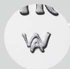
ARTIST Adolph A. Weinman's INITIALS