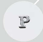
PHILADELPHIA MINT MARK