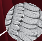
CRAFTED IN HIGH DETAIL USING NEW TECHNOLOGY