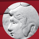
LIBERTY'S BONNET AND EYE