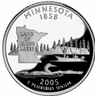
The Minnesota Commemorative Quarter-Dollar.