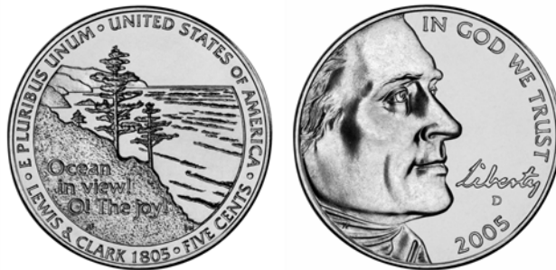
The "Ocean in View" Nickel

The Federal Reserve Bank will release the "Ocean in View" nickel in August 2005. The United States Mint is currently finalizing plans for launch ceremonies for the "Ocean in View" nickel that will be held in early August in Washington and Oregon.