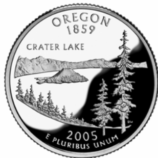
The Oregon Commemorative Quarter-Dollar