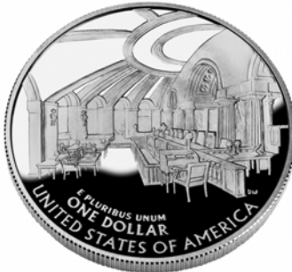
The 2005 Chief Justice John Marshall Silver Dollar

In a conference report to Public Law 104-52, enacted November 19, 1995, which created the United States Mint Public Enterprise Fund (PEF), Congress directed the United States Mint to report quarterly on implementation of the PEF. This report is designed to fulfill that requirement.