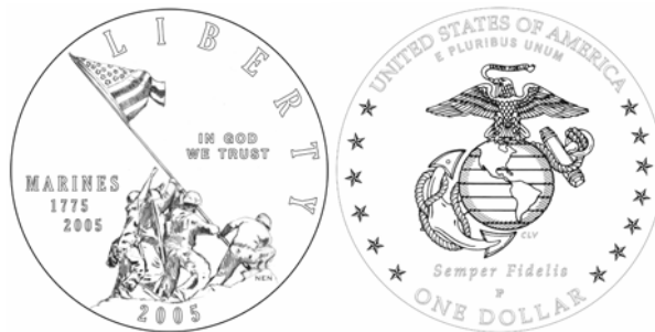
The Marine Corps 230 th Anniversary Silver Dollar

A surcharge from the sale of each coin is authorized to go to the National Museum of the Marine Corps in Quantico, Virginia, which is currently being developed through a partnership between the Marine Corps Heritage Foundation and the United States Marine Corps.